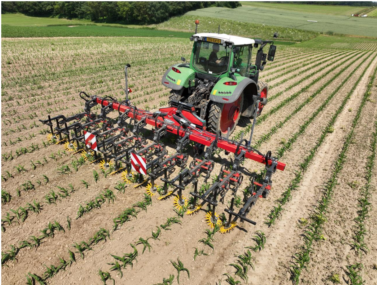
Kverneland inter-row-cultivator Onyx with guidance interface Lynx