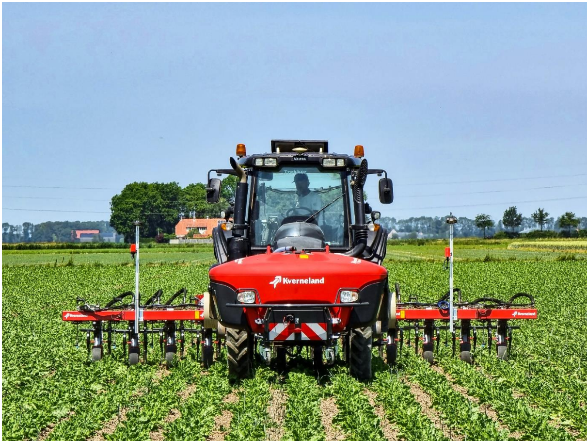
Combined systems in development: here Kverneland Onyx with iXtra LiFe

In order to extend application possibilities, Kverneland will offer combined systems of mechanical weeding with chemical crop care and fertiliser application: