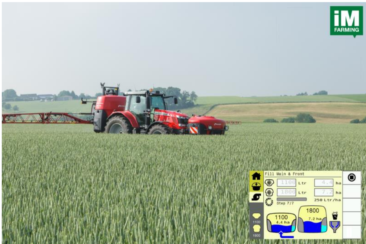
TwinFill is a combined filling program for the front and rear mounted sprayer

August 2023 Nieuw-Vennep, The Netherlands