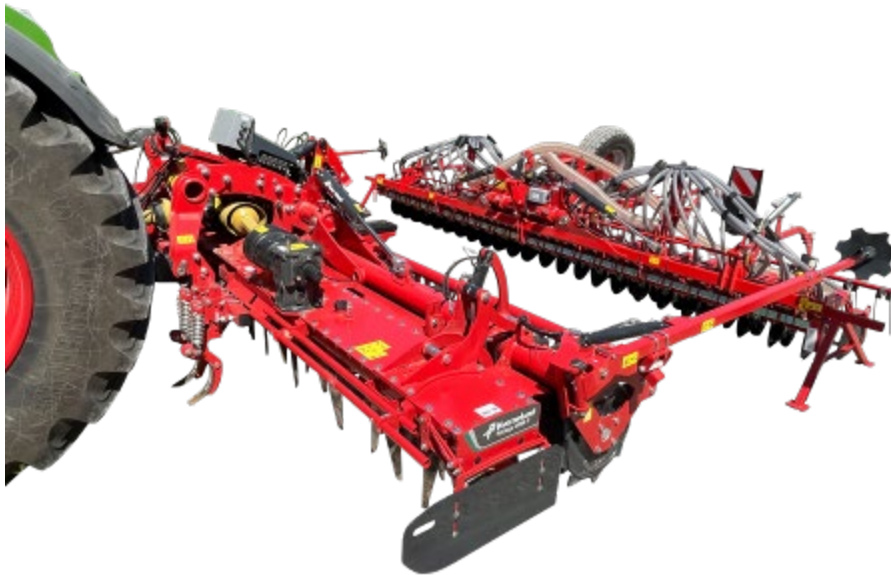
Kverneland coulters bar f-drill CB F with easy CAT. II connection

Depth adjustment and coulters pressure can be easily adapted by hydraulics or as ISOBUS version via the terminal. The CAT. II easy connection allows quick coupling with the ROTAGO F power harrow. The right finish is ensured with the S-tine following harrow.