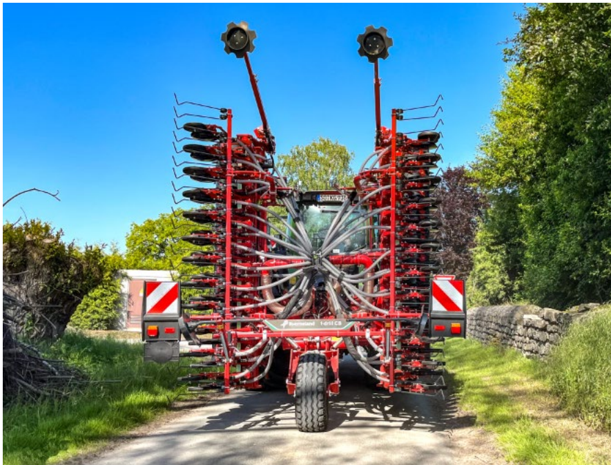
Kverneland coulters bar f-drill CB F safe road transport with support wheel

For better load balance and extra stability, a supporting wheel is available which can be mounted to the coulter bar. No uncoupling of the top linkage is needed. The constant supporting force on the wheel ensures smooth run, legal transport weights and increase driver's safety and comfort.