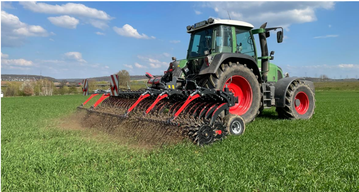
Kverneland Helios 2060 F

Efficient weed control is needed for healthy plant growth as the basis for yield and profit, as well as for a safe food production. At the same time, the protection of the environment has become a key topic in today's agriculture. With the Farm to Fork Strategy, recent European regulations and policies have defined new standards and reduced the kinds of components allowed.