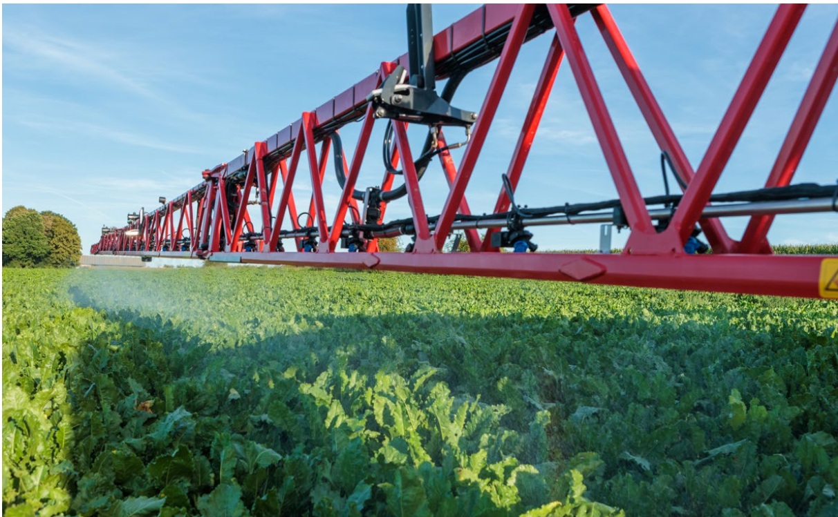
iXflow-Pulse – best crop coverage under changing conditions

November 2023 Nieuw-Vennep, The Netherlands