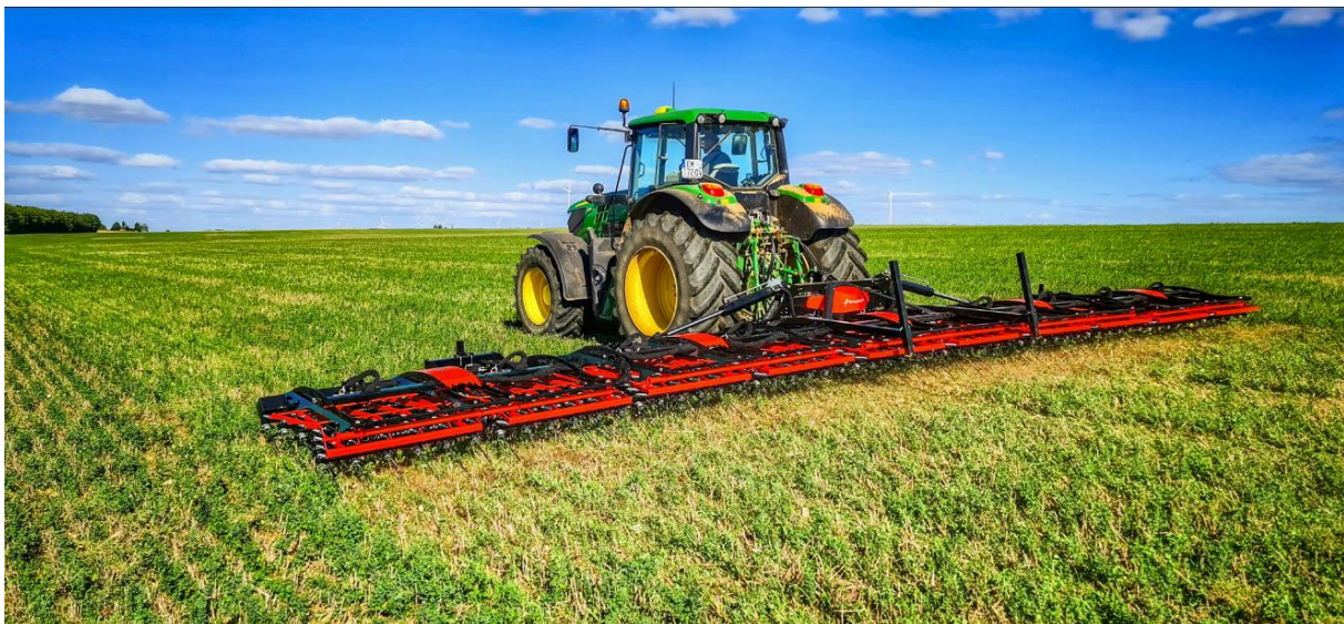
Kverneland Arcadia tine harrow with 12m working width

Kverneland is extending its range of mechanical weeding equipment with new models of high performance tine harrow weeders called Arcadia. This complements the range of implements for mechanical weed control, which already consists of Helios rotary hoes, Onyx inter-row cultivators and Lynx guidance interfaces.