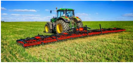
Kverneland-Arcadia-12m in the field