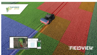
Image for the Press Release announcing the collaboration.