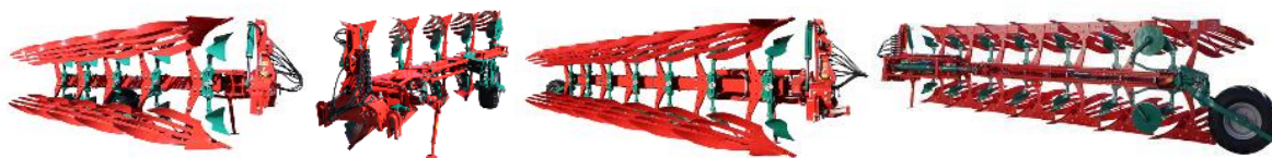
Kverneland 3300 B Variomat