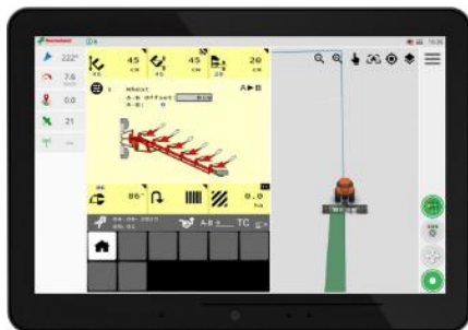
Kverneland FURROWcontrol® and Tellus 1200 Kverneland Auto-line system

When the same features apply to each model of this new range, the Kverneland 3500 B i-Plough® stands out with its Isobus functions. The most essential settings are done from the tractor cabin: highlight in this is that the driver can switch from In-furrow ploughing to On-land ploughing with one finger tip. Other functionalities like FURROWcontrol® for straight furrows following an A-B line, bring an extra level of performances and comfort. Likewise, the Kverneland Sync enables seamless data transfer for optimal machine management and performance tracking.