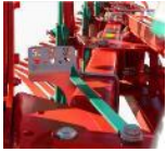
Kverneland 3400 B variomat working width indicator.jpg