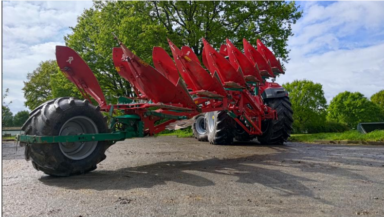
Kverneland 3400 B Variomat® with TTS