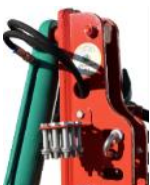
Kverneland 3400 B Variomat shear bolt storage.jpg