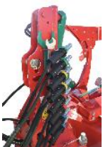
Kverneland 3400 B Variomat hydraulic handles.jpg