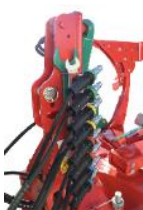
Kverneland 3400 B Variomat hydraulic handles.jpg