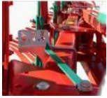
Kverneland 3400 B variomat working width indicator.jpg