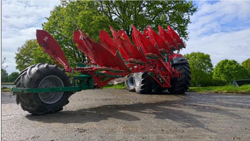
Kverneland 3400 B Variomat® with TTS