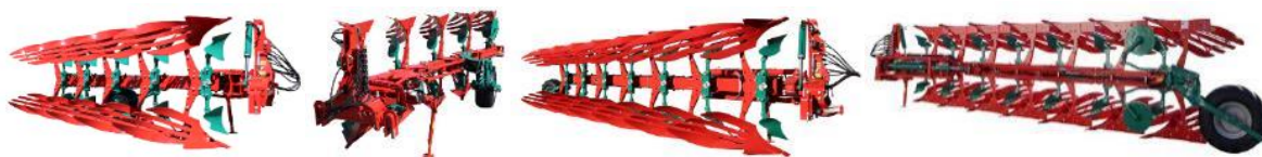
Kverneland 3300 B Variomat