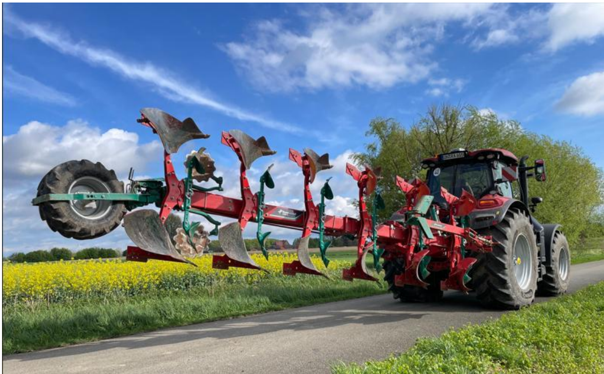
Kverneland 3400 B Variomat®. 3 point linkage, transport wheel or Trailer Transport Solution (TTS)

The range of Kverneland new generation shear bolt ploughs is designed for professionals. It is the logical step forward after the successful launch of the new generation auto-reset ploughs (2019). This new range builds on the existing well-known benefits in using Kverneland ploughs and goes beyond with some new relevant features.