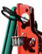
Kverneland 3400 B Variomat shear bolt storage.jpg