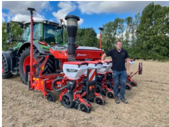
Kverneland Optima V GEOFORCE-Field