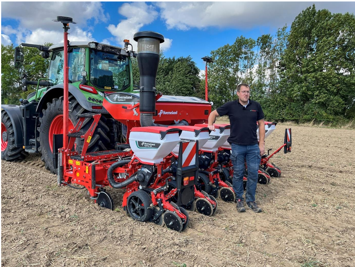
Kverneland Optima V SX sowing row with GEOFORCE system

Kverneland presents latest update to its precision sowing technology: the GEOFORCE automatic pressure control system is now available on all Kverneland Optima models with SX sowing units.