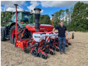
Kverneland Optima V GEOFORCE-Field